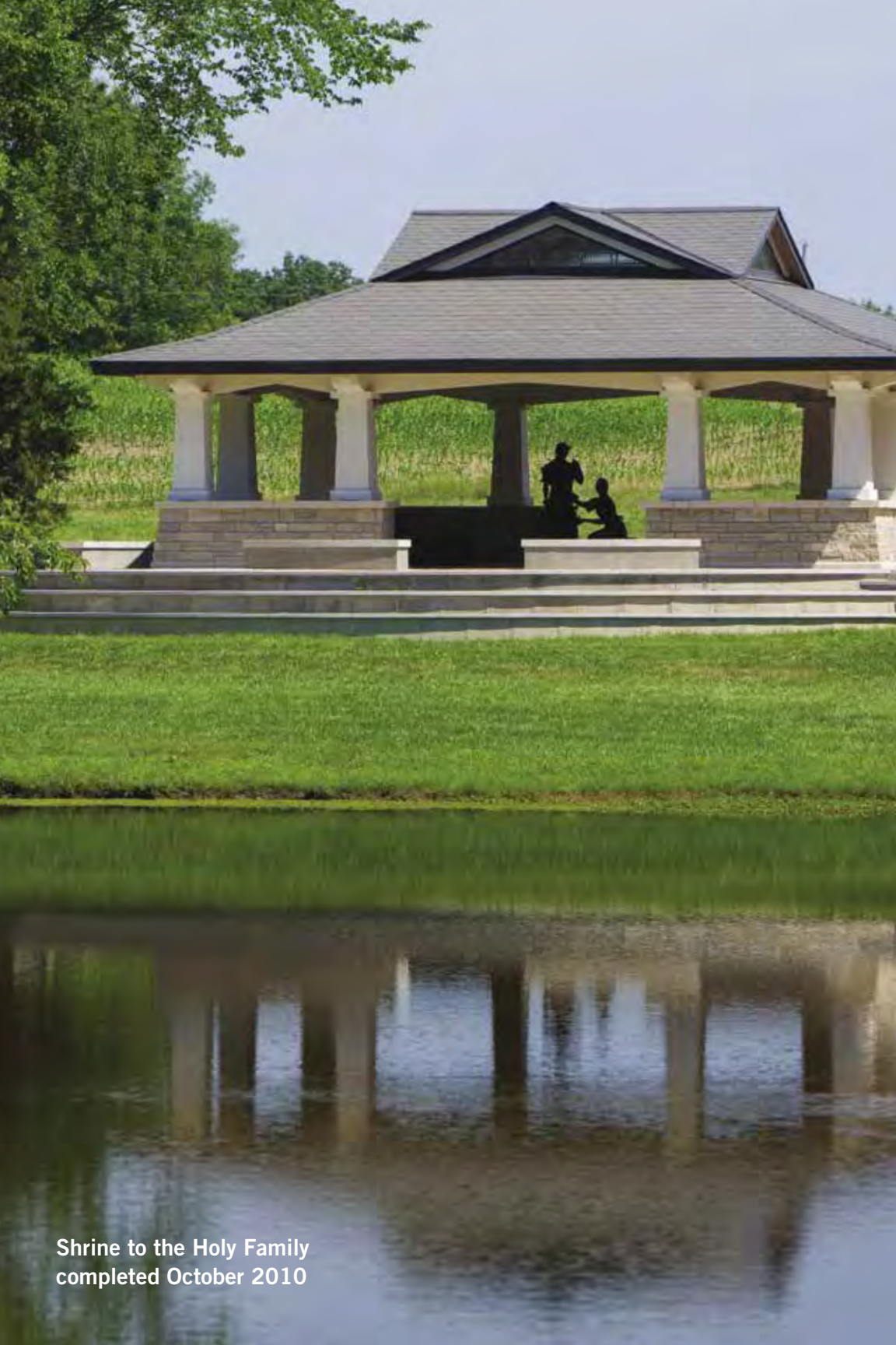
Shrine to the Holy Family completed October 2010